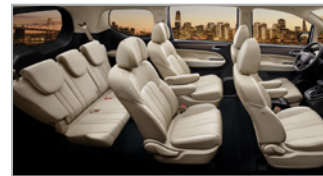
SPACIOUS CABIN Savor the luxury of the large, open cabin and the power sunroof.