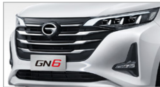
SHARP ELEGANCE Stand out with the sculpted design and striking details.