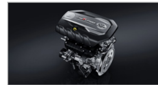
SUPERIOR PERFORMANCE Welcome the driving dynamics with the Turbo Petrol Engine and AISIN 6-speed Automatic Transmission.