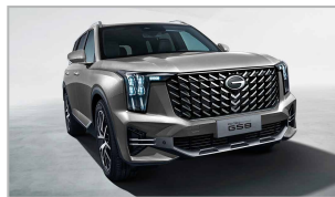
DYNAMIC DESIGN Rule the roads with its striking grille design and towering form.