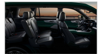
SUPERIOR LUXURY Indulge in spacious interiors with practical seating solutions.