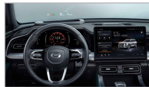
INNOVATIVE CABIN Be at ease with the full range of Advanced Driving Assistance Systems.